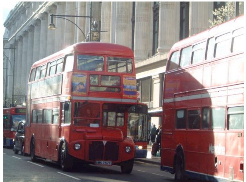
London Buses in Oxford Street LONDON

The London and Stratford-upon-Avon visits are normally the main and favourite visits. However, as soon as we know the length of stay the student has booked for, we will then know what kind of programme to prepare.